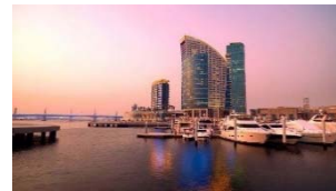
Dubai Festival Marina Dubai Festival City Dubai, UAE