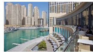
Marina Mall EMAAR Dubai Marina, UAE