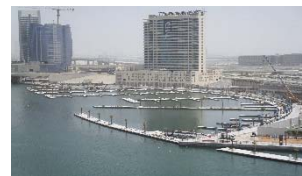
Marasi Marina Business Bay Dubai Properties Dubai, UAE