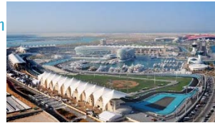
Yas Marina Aldar Properties Abu Dhabi, UAE