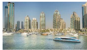
West Marina - Stage 2 EMAAR Properties Dubai, UAE