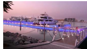
DIMC-Super Yacht Marina Dubai Intl. Marine Club Dubai, UAE