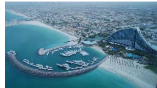
Jumeirah Beach Hotel Marina Dubai Investment Group Dubai, UAE