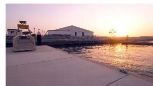
Sky Dive Replacement Pontoons Sky Dive Dubai Dubai, UAE