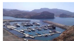
Barr Al Jissah Turner Construction Muscat, Oman