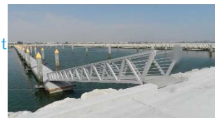
Dareen Port Expansion STFA/Aramco Qatif, Saudi Arabia