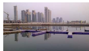
Najmat Marina Reem Developers Abu Dhabi, UAE