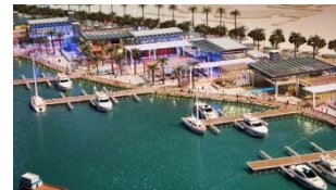
Marsa Al Seef Meraas Dubai, UAE