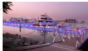
DIMC-Super Yacht Marina Dubai Intl. Marine Club Dubai, UAE