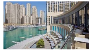
Marina Mall EMAAR Dubai Marina, UAE