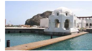
Qasr Al Alam Marina Filnternbetcn Muscat, Oman