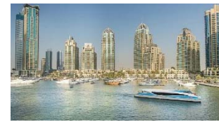
West Marina - Stage 2 EMAAR Properties Dubai, UAE