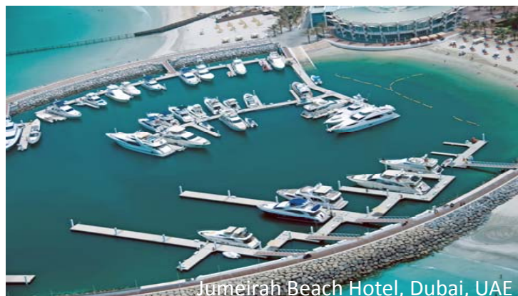
Jumeirah Beach Hotel, Dubai, UAE