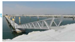
Dareen Port Expansion STFA/Aramco Qatif, Saudi Arabia