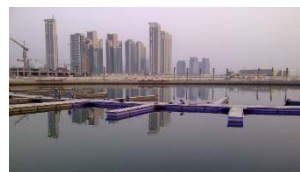
Najmat Marina Reem Developers Abu Dhabi, UAE