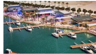
Marsa Al Seef Meraas Dubai, UAE