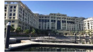
Cultural Village Dubai Properties Dubai, UAE