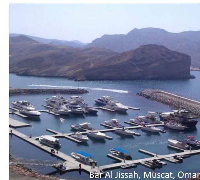
Bar Al Jissah, Muscat, Oman

From evaluation to implementation and training, it doesn't stop there. At Septech, we offer you ongoing support and customer service to ensure that you are always getting the most from your Septech MMS system.