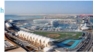
Yas Marina Aldar Properties Abu Dhabi, UAE