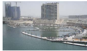
Marasi Marina Business Bay Dubai Properties Dubai, UAE