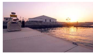
Sky Dive Replacement Pontoons Sky Dive Dubai Dubai, UAE