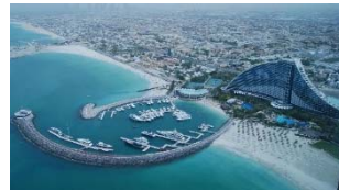
Jumeirah Beach Hotel Marina Dubai Investment Group Dubai, UAE