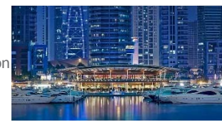
Dubai Yacht Club Marina EMAAR Properties Dubai, UAE