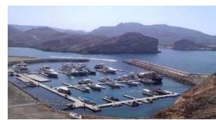
Barr Al Jissah Turner Construction Muscat, Oman