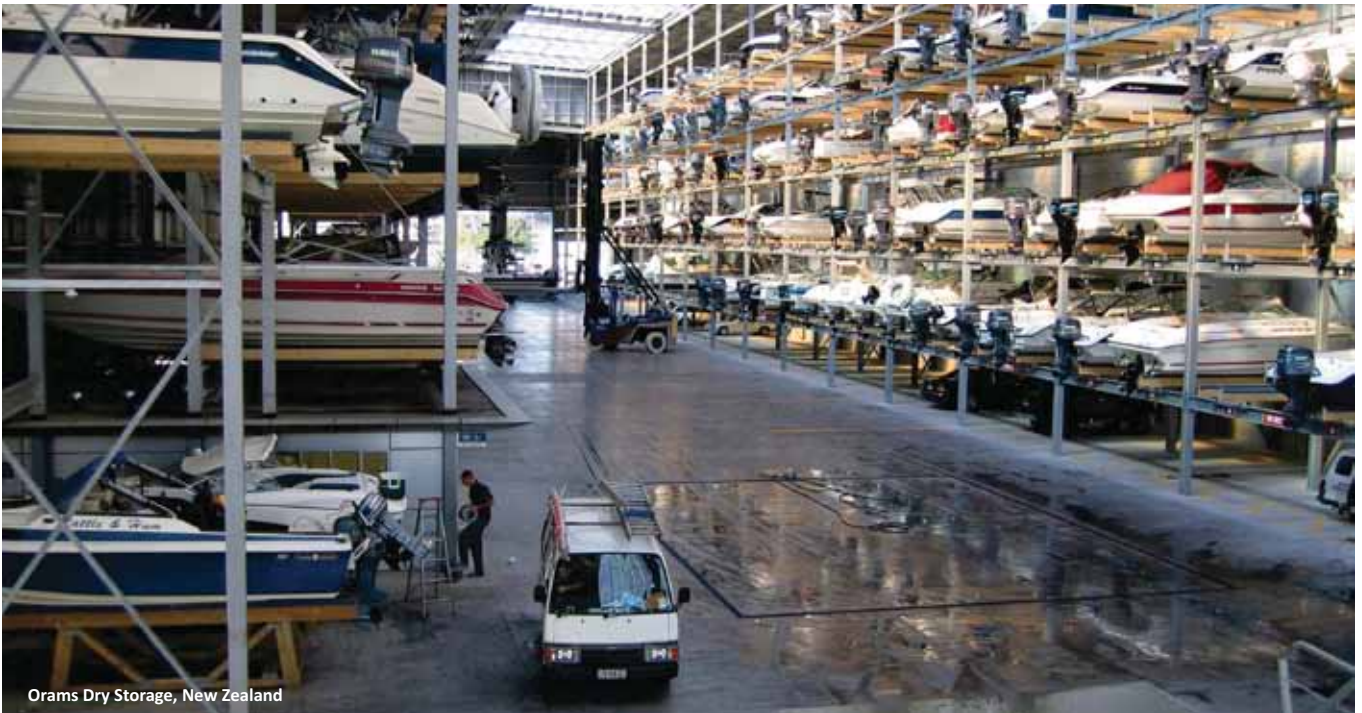
Orams Dry Storage, New Zealand