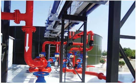
Sharjah Municipality Capitox STP, Sharjah, UAE